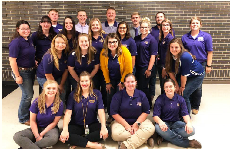
Students from the WIU CFFA Chapter hosted the annual Greenhand Conference in Macomb Sept. 6.