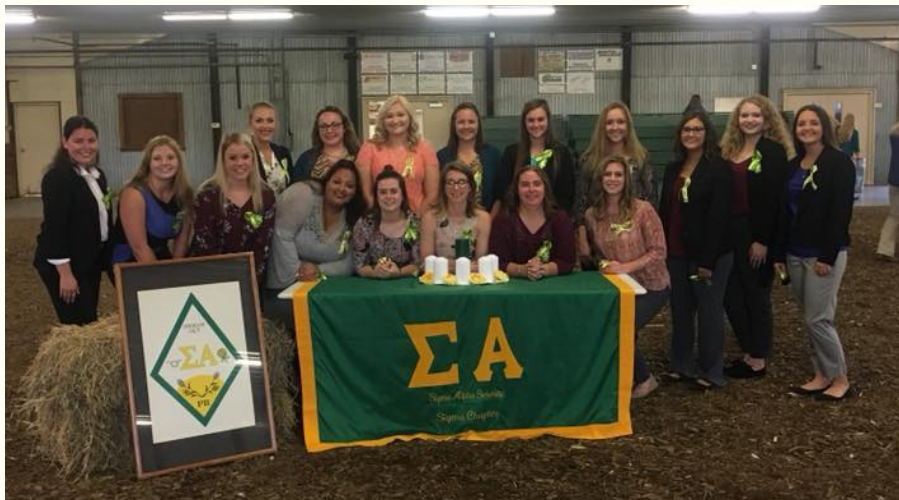
Congrats to the membership candidates of Sigma Alpha.