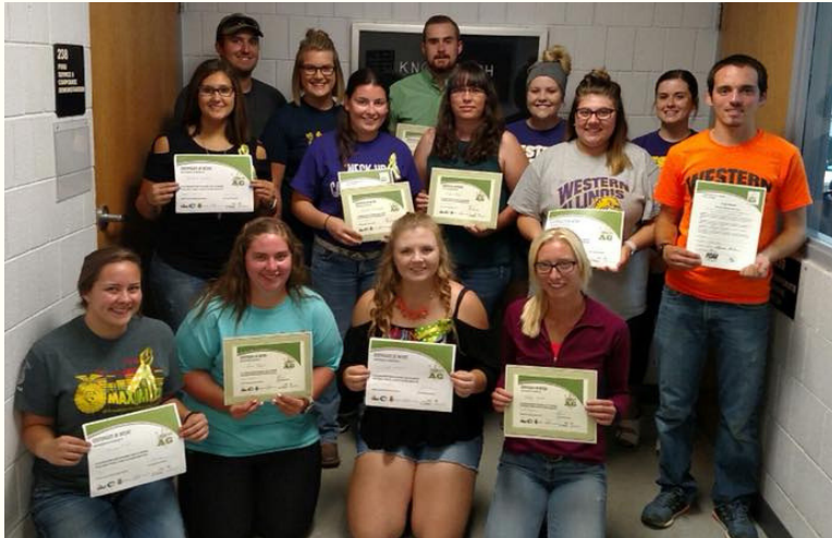
Happy National Teach Ag Day! #TeachAG