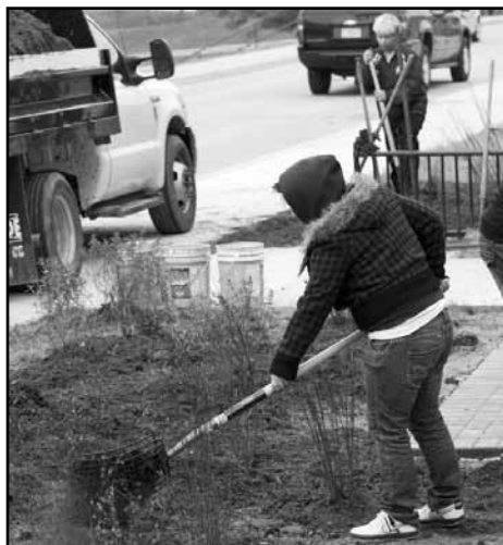
WIU students and staff work on campus cleanup and beautification during WeCare Fall 2009.