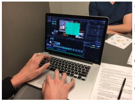
Editing the video for the Western Challenge, 04/2017

Join the Film Club! Mondays @ 6 pm (220 Simpkins)