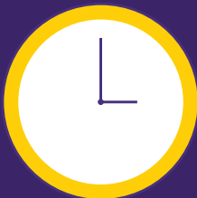
Time Management Strategies