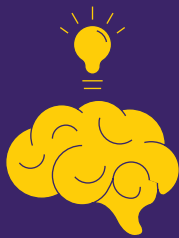
Effective Study Strategies

http://www.wiu.edu/tasc/academic_success_tools.php