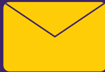
Email Etiquette Guide