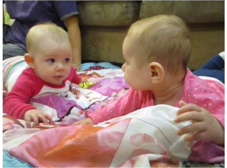
Enjoying Tummy Time with Our Friends

Standard: Children demonstrate the desire and develop the ability to engage and interact with other children.