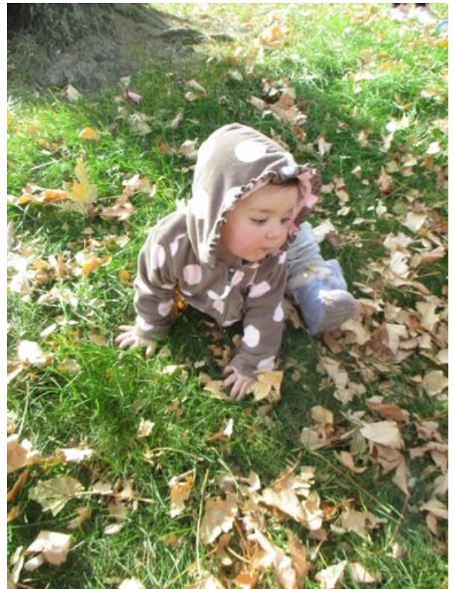
Discovering the Leaves and Green Grass