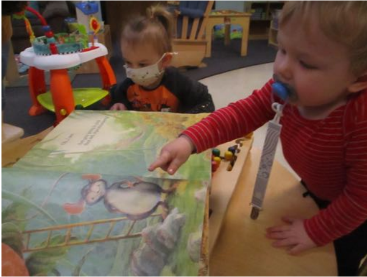
Exploring Our Big Books