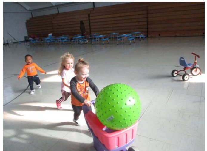
Running in the Gym