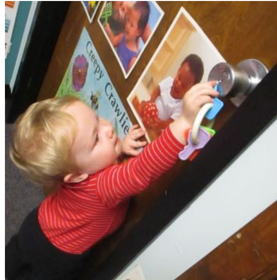
Utilizing the Play Keys to Open the Door