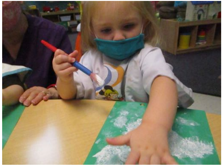
Creating Pictures with our Brushes and our Finger Paint