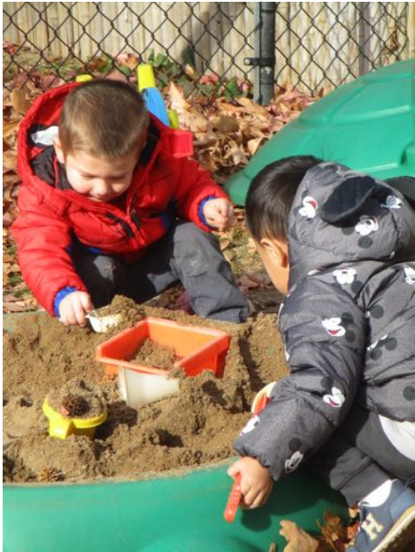
Scooping and Pouring Sand