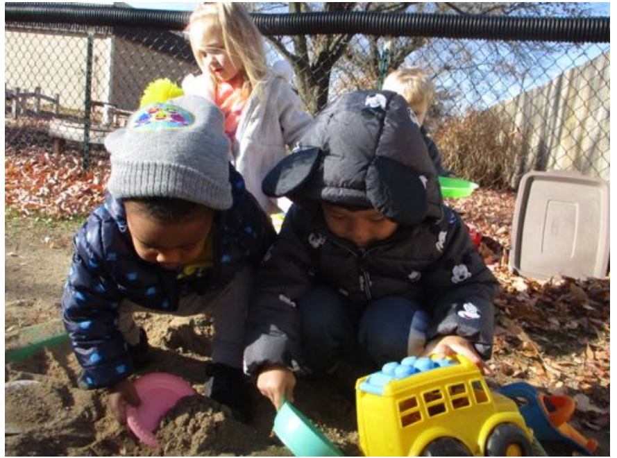
Our Sand Box