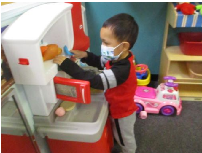
Exploring the Play Food in our House Keeping Area

Standard: Children demonstrate the desire and develop the ability to engage and interact with other children.