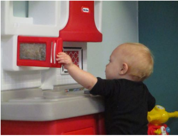
Peeking Inside the Microwave