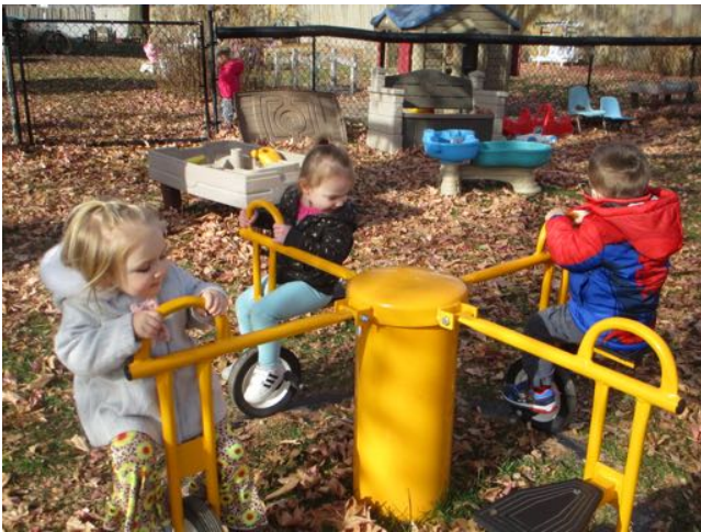
Pedaling on the Trike-Go-Round