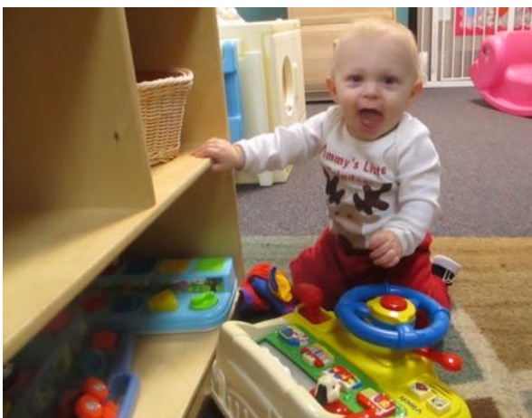
Exploring the Baby Toys