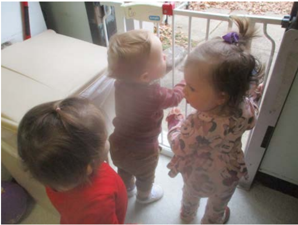
Looking Out at our Playground with Our Friends