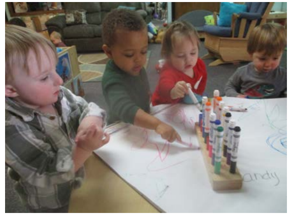
Exploring Our Markers