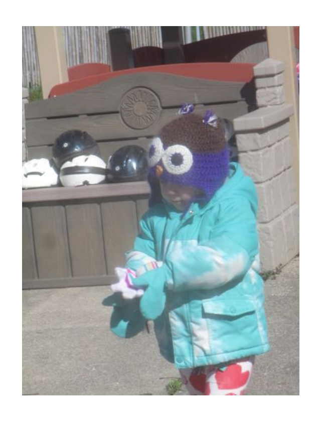
Thank You for a Wonderful Week!