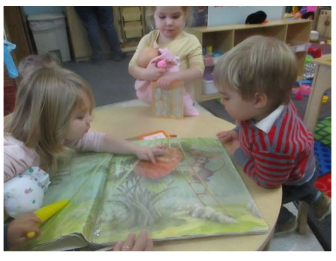
Enjoying Our Big Books!