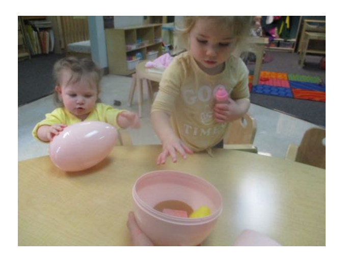
Standard: Children demonstrate the ability to use knowledge, previous experiences, and trial and error to make sense of and impact their world.