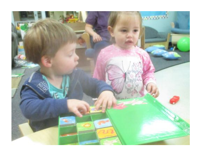
Exploring the Mini Books