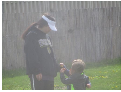
Standard: Children demonstrate the desire and develop the ability to engage, interact, and build relationships with familiar adults.