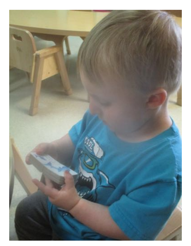
Have a Great Weekend! We Will See You on Monday!