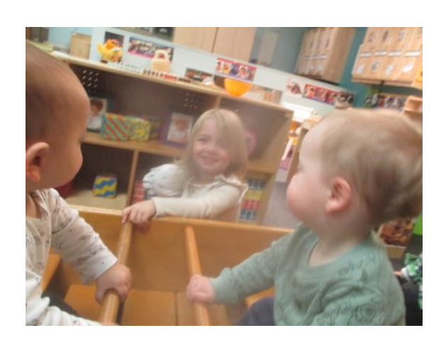
Sharing Songs and Singing with our Wooden Row Boat