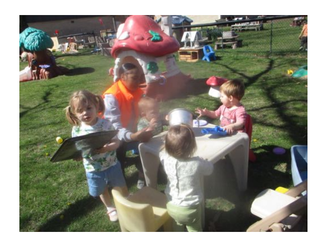
Standard: Children demonstrate an awareness of and the ability to identify and express emotions.