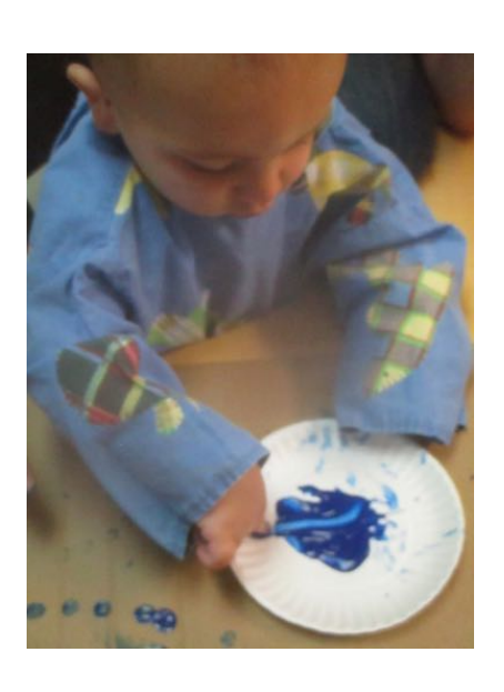
Painting our Card Board Clouds