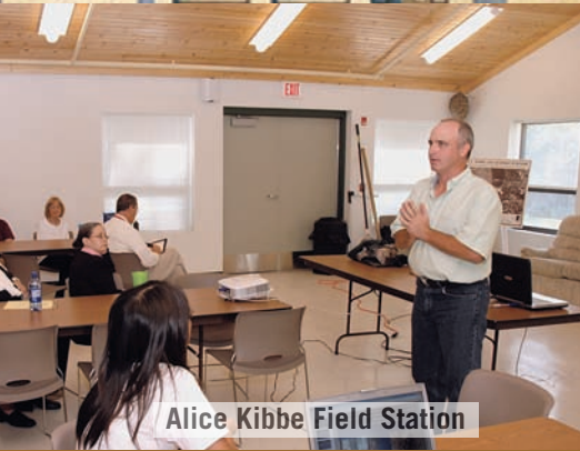
Alice Kibbe Field Station