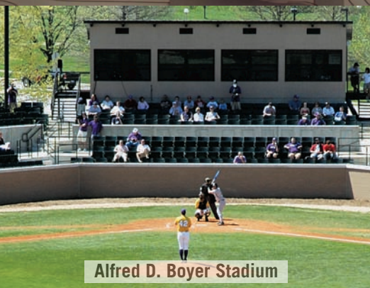
Alfred D. Boyer Stadium