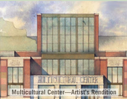
Multicultural Center—Artist's Rendition