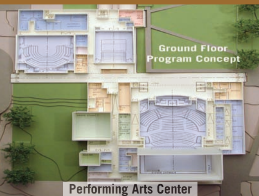
Performing Arts Center