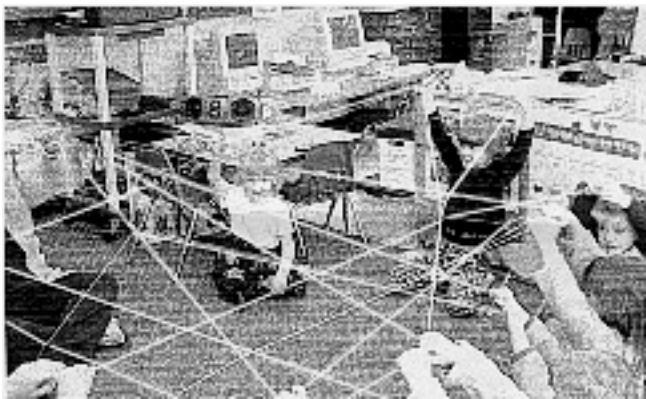
Avon children make a “Spider Web” as they explore spacial awareness and patterning during a recent activity.

July 30, 31, and August 1, 2001 — ArtExpress Staff will conduct Expressive Arts Training Workshop for new replicating sites at Horrabin Hall, WIU, Macomb, Illinois