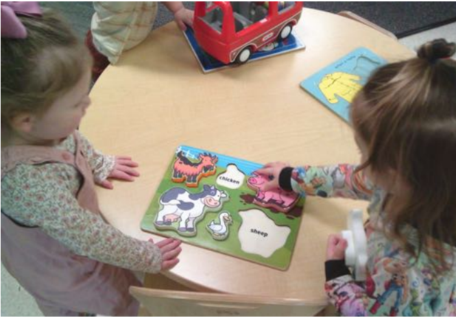
Discovering Our Puzzles