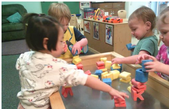
Creating Alphabet Towers