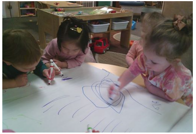
Exploring Our Markers and the Big Sheets of Paper