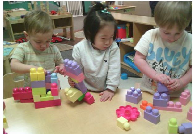
Building our Structures