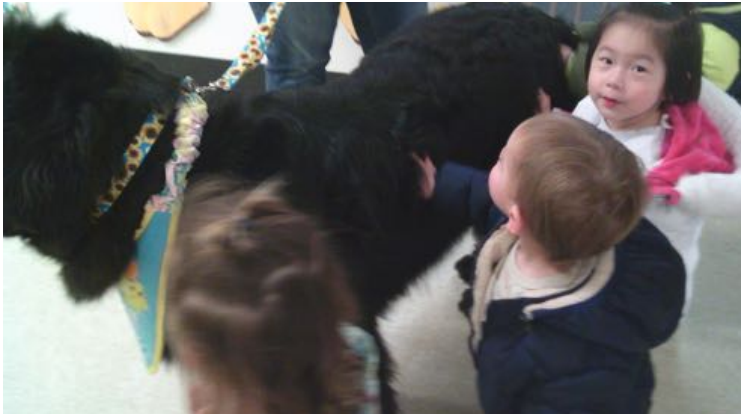
Saying “Hello” to the Therapy Dogs