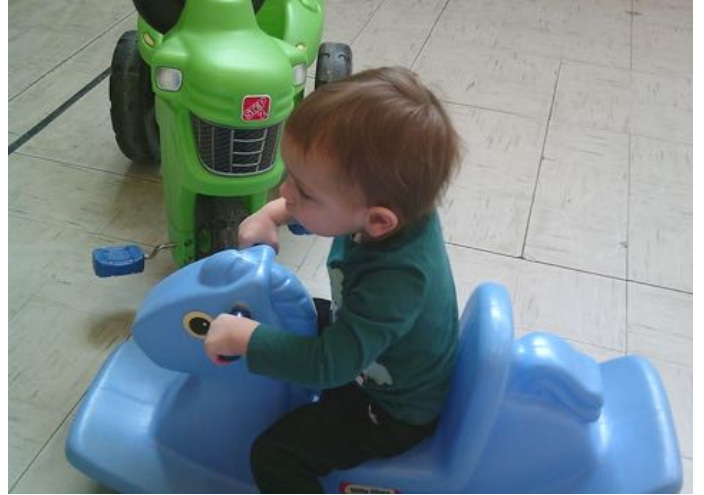
Enjoying our Gym