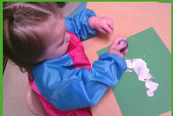
Exploring the Snow and the White Paint