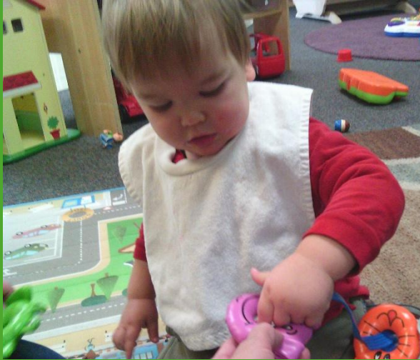
Using Our Fine Motor Skills to Explore the Strings and Soft Toy Animals