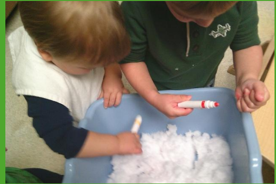
Collecting a Container of Snow and Adding our Markers to the Snow Pile!