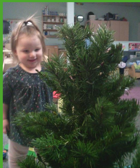
Decorating Our Room for the Holidays!