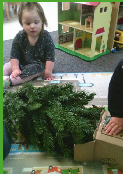
Peeking in the Box to Bring Out the Tree