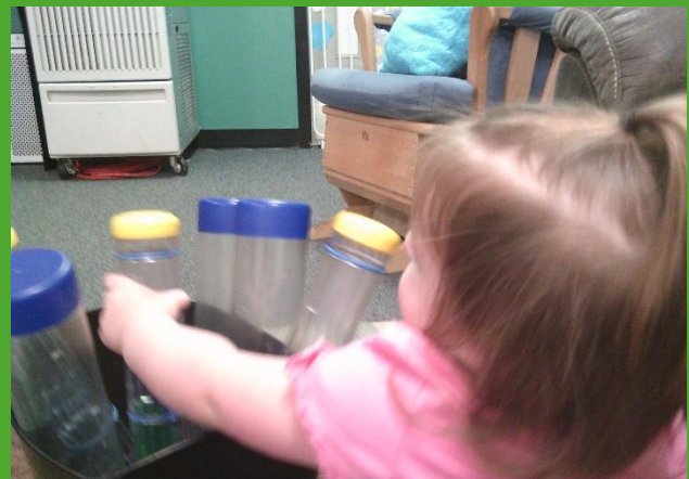
Sharing Songs and Discovering the Cylinders

Standard: Children demonstrate the ability to use knowledge, previous experiences, and trial and error to make sense of and impact their world.