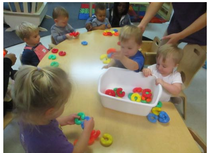
Counting the Links and Putting them Together