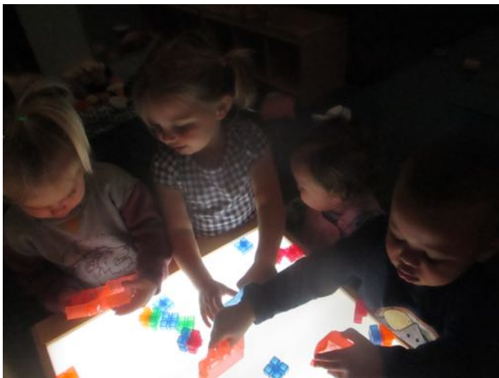
Exploring the Square Shapes at our Light Table

Standard: Children demonstrate the desire and develop the ability to engage and interact with other children.