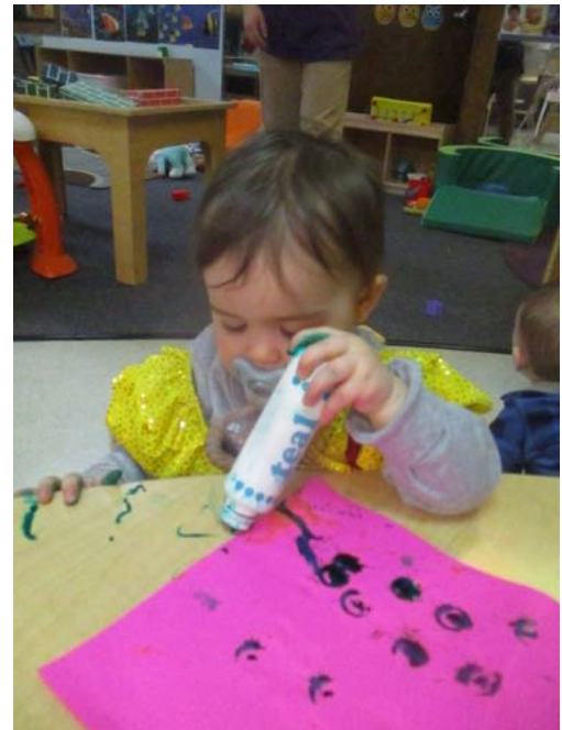
Creating Pictures with Paint Dots!