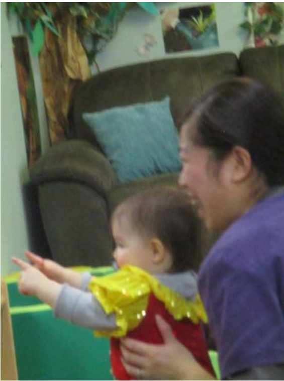
Exploring the Dress Up Costumes and Seeing Ourselves in the Mirror!