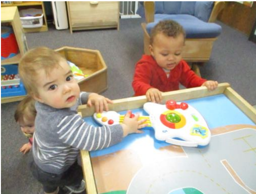
Exploring the Toy Guitars!