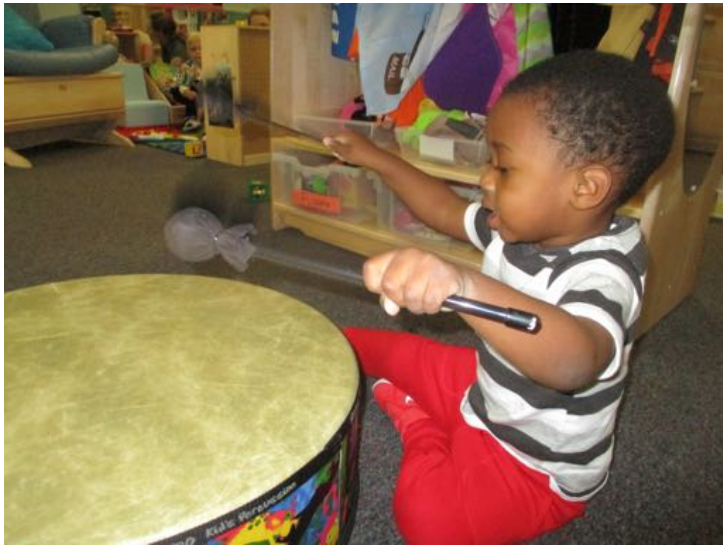
Playing the Gathering Drum