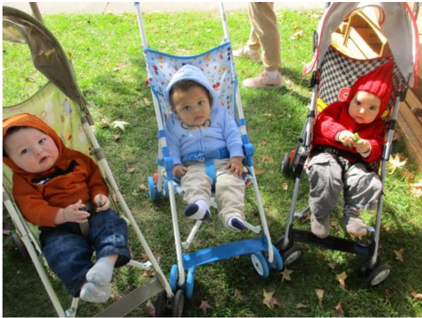
Stroller Rides Across our Playground