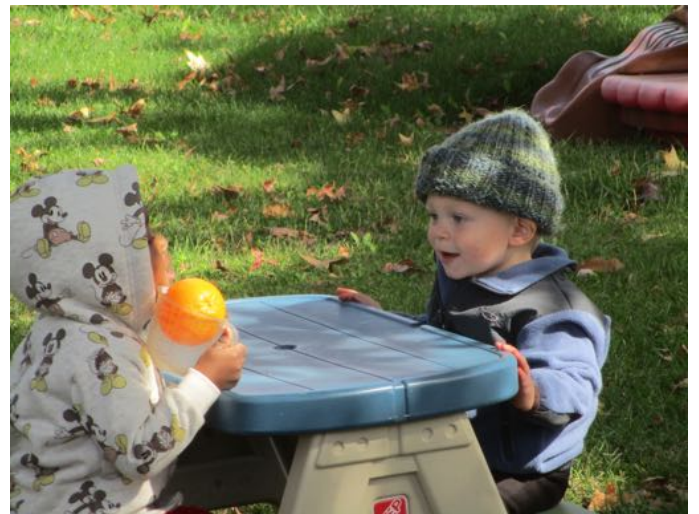
Having Great Conversations with Our Friends

Standard: Children demonstrate the ability to understand and convey thoughts through both nonverbal and verbal expression.