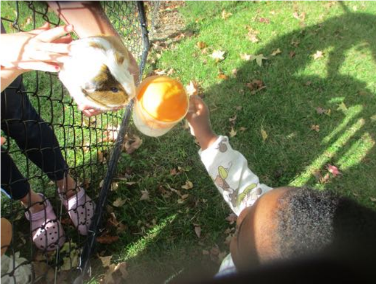
Feeding the Guinea Pigs