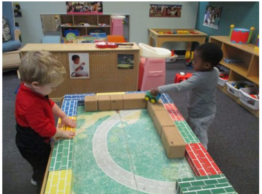
Exploring Cars and Trucks with our Cardboard Race Track