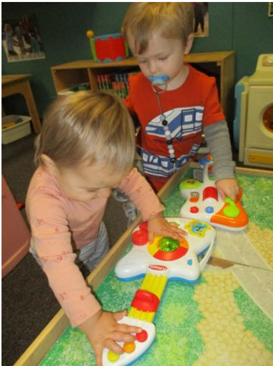
Exploring the Guitars in our Room