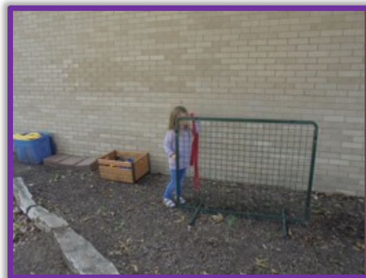
Creating with the weaving frame.