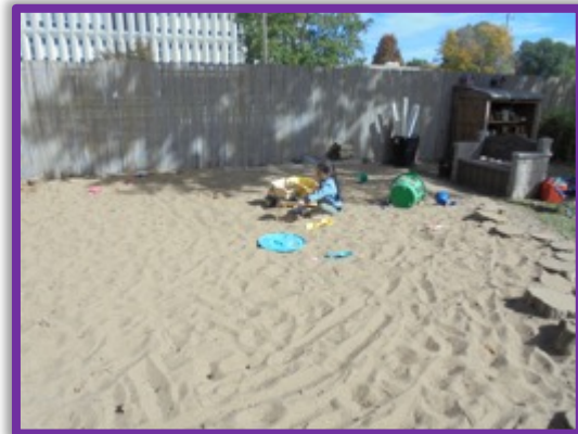
Digging in the sandbox.