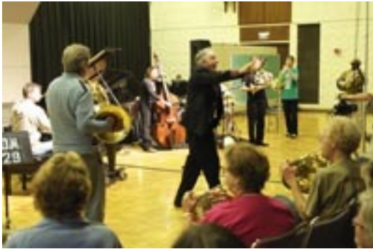
Amram, ensemble, and class in the final chorus!