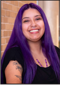
Arts and Sciences Scholar

Each of Western Illinois University's four academic colleges and the University Libraries selects a graduating senior as the college's outstanding student. College Scholars receive a gold medallion on a purple and gold ribbon in recognition of their high achievement.